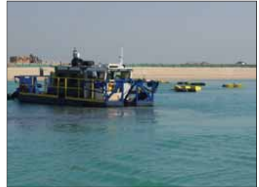
A Model 5012 LP removes silt from channels at a resort in the Middle East.