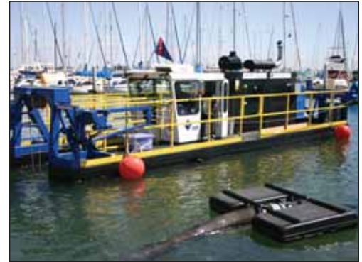
A Model 5012 HP removes sand from a large marina in California.