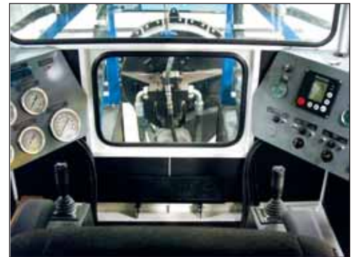
All Versi-Dredge® models come standard with joystick controls and oversized gauges for ease of operation.